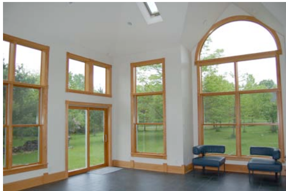
VBC Office in Ithaca, NY

For people who cannot travel to Ithaca, a telephone consult may be the best alternative. In this case, I will contact your veterinarian in advance of the consult to discuss your pet's medical record. At the scheduled appointment time, you will call me and the consult will last one hour.