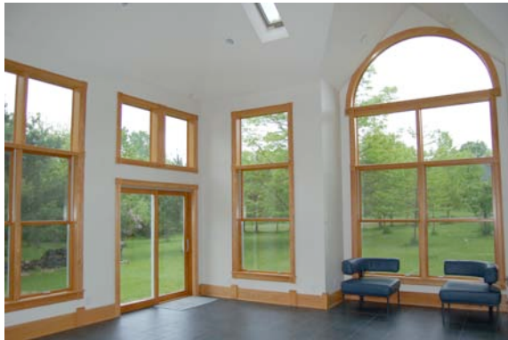
VBC Office in Ithaca, NY

The office consultation (1.5-2 hours) is held in a quiet and spacious sunroom at the VBC Clinic located in a rural section of Ithaca, NY. The office setting provides a calm, homelike atmosphere that allows for accurate behavioral assessments.